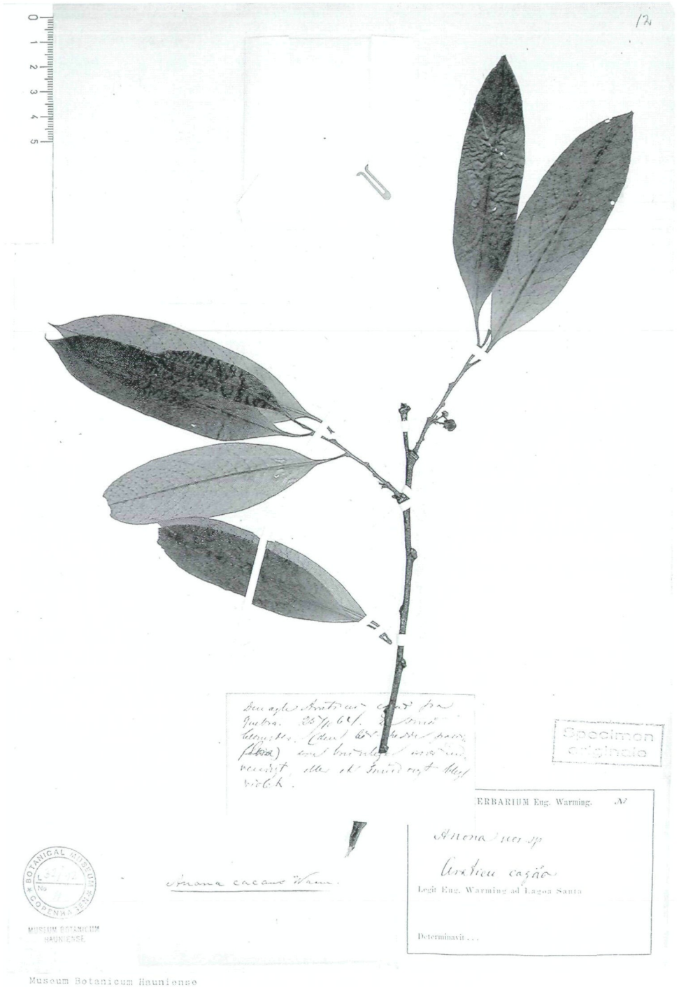
Fig. 1: Lectotype of Annona cacans WARM. (E. Warming s.n. [C])