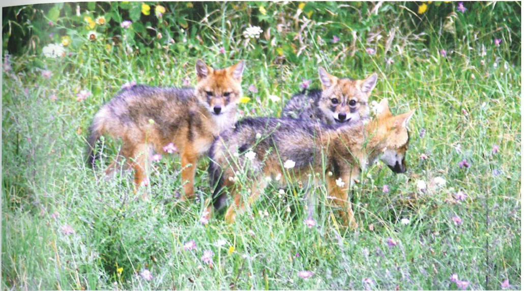
Fig. 3: The three young golden jackals from the National Park Neusiedler See-Seewinkel/Fertö-Hanság in the middle of August.

The locality is situated in the National Park Neusiedler See-Seewinkel/Fertö-Hanság near the Hungarian border (Fig. 1).