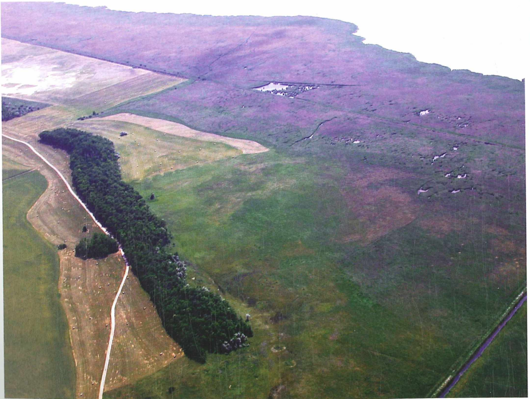
Fig. 2: Aerial photograph of the Neudegg, showing the small wood and thickets with adjacent meadows, the reed belt and fields.