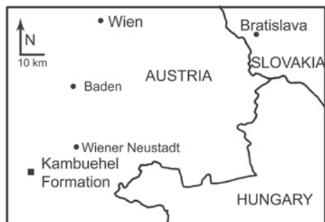
Fig. 1. Map of the eastern portion of Austria, showing the location of the Kambühel Formation.

interest because of the well-preserved decapod fauna associated with it (MÜLLER 2004). Comparable decapod assemblages found in other localities in Europe usually consist of galatheids, Xanthidae sensu lato , and pagurids (MÜLLER, 2004). The fossils are typically small (a few millimeters to a few centimeters across), consist almost entirely of dorsal carapaces, and are well preserved (MÜLLER 2004); no articulated remains are known. The Kambühel Formation is further important because it was deposited in the Thanetian (late Paleocene) (TRAGELEHN 1994), when coralgall framework reefs were beginning to once again become common following the K/T mass extinction (PERRIN 2002). The age relationships of the unit were based upon microfauna and microflora (PLÖCHINGER 1967). Danian reefs from the Iberian Peninsula (AGUIRRE et al. 2007) and Italy (VECSEI et al. 1997) have been found, but these appear to be rare and no decapods have been reported from these sites. Therefore, the Kambühel Formation should elucidate the recovery of decapods from the end-Cretaceous mass extinction.