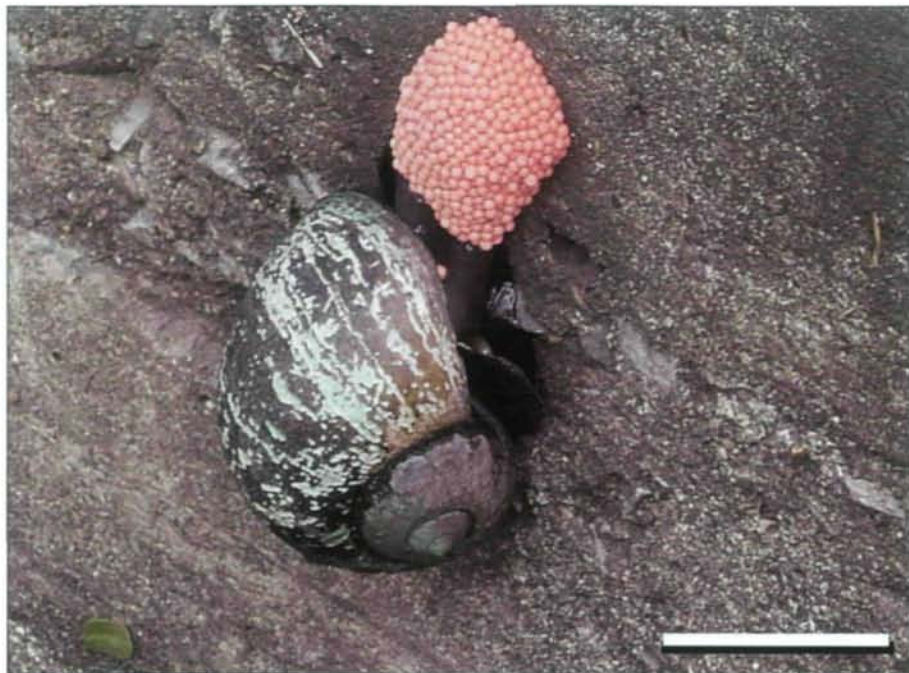
Fig. 1: Female cherry snail laying an egg mass on a cement wall above the water surface at a pond in Bangkok, Thailand. Scale bar = 5 cm.

P. ANURAKPONGSATORN R. CHAICHANA J. MAHUCHARIYAWONG T. SATAPANAJARU Department of Environmental Science Kasetsart University P.O. Box 1072 Chatuchak, Bangkok 10900 Thailand