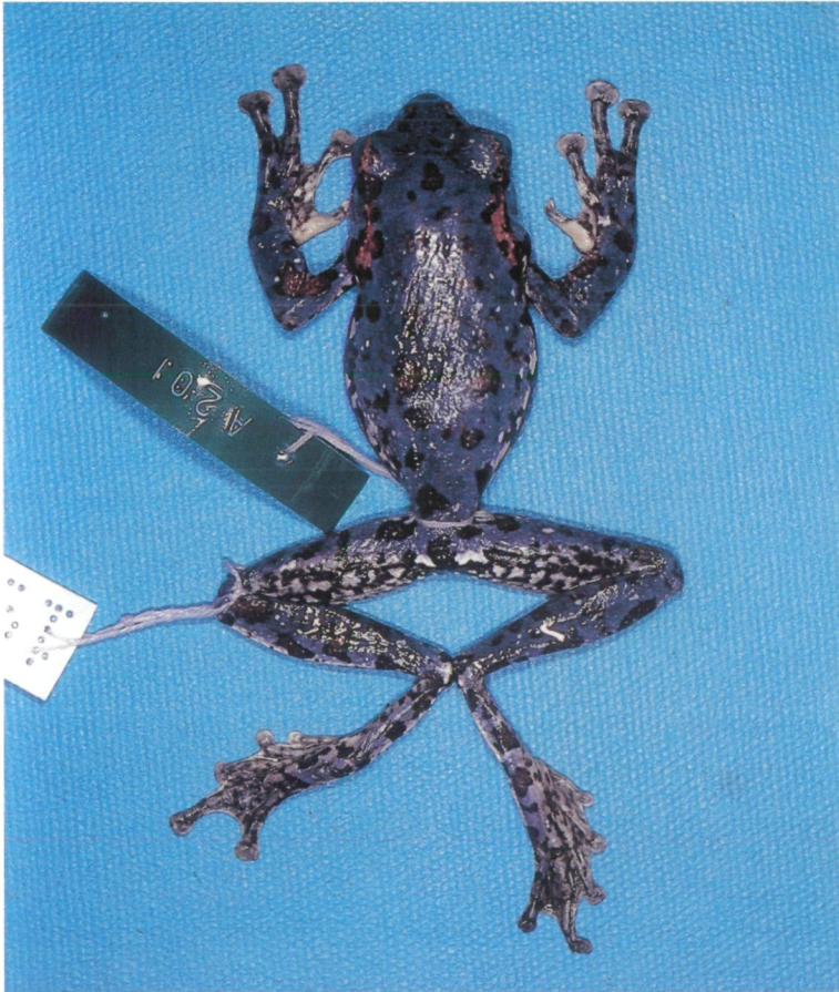
Fig. 3: Holotype of Rhacophorus duboisi nov. sp., dorsal view of adult male, MNHN 1998.5971, fixed specimen (SVL 61.5 mm).