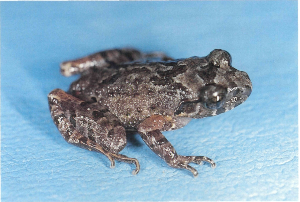
Fig. 2: Holotype of Leptotalax pluvialis nov. sp., dorsal view of adult male, MNHN 1998.5675, in life (SVL 22.0 mm).