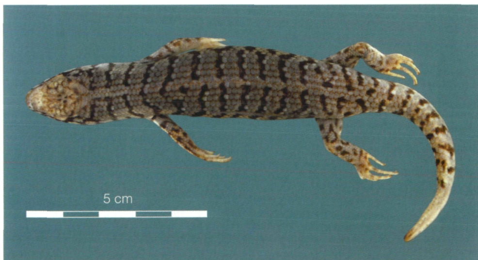
Fig. 6: Younger female of Trachylepis dichroma sp. nov. (ZMB 61836), in which the cross banding reaches nearly to the centre of the back.

Abb. 5: Zwei Weibchen von Trachylepis dichroma sp. nov. mit deutlicher Querbänderung an Kopf und Vorderkörper.