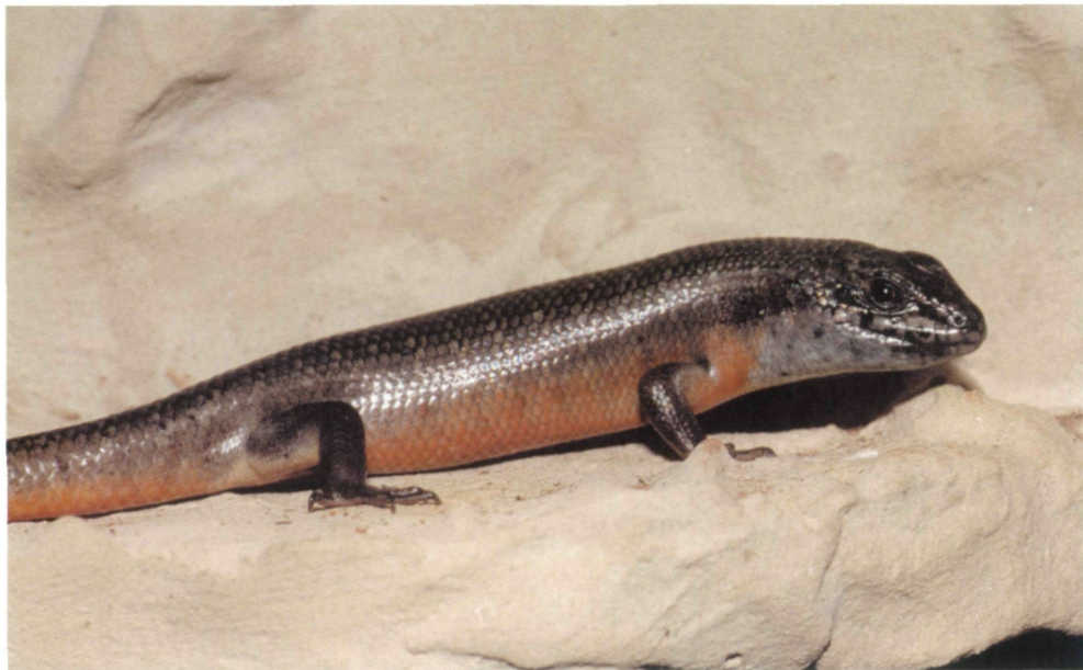
Fig. 1: Holotype of Trachylepis dichroma sp. nov. in life.

Abb. 1: Holotypus von Trachylepis dichroma sp. nov. im lebenden Zustand.