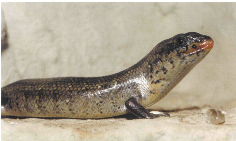
Fig. 4: Lateral view of the female paratype (ZMB 67017) of Trachylepis dichroma sp. nov. in life.

Abb. 3: Lebendfärbung der Unterseite eines Männchens von Trachylepis dichroma sp. nov. (Holotypus, oben) im Vergleich zur Lebendfärbung der Unterseite eines Weibchens (Paratypus ZMB 67017, unten).