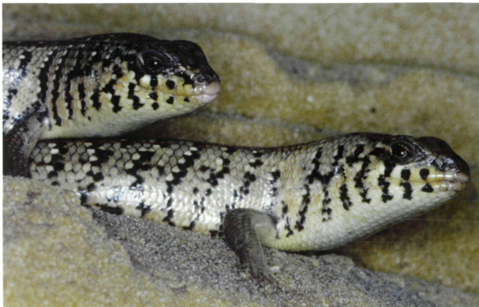
Fig. 5: Two females of Trachylepis dichroma sp. nov. with distinct cross banding of the head and anterior body.

Abb. 5: Zwei Weibchen von Trachylepis dichroma sp. nov. mit deutlicher Querbänderung an Kopf und Vorderkörper.