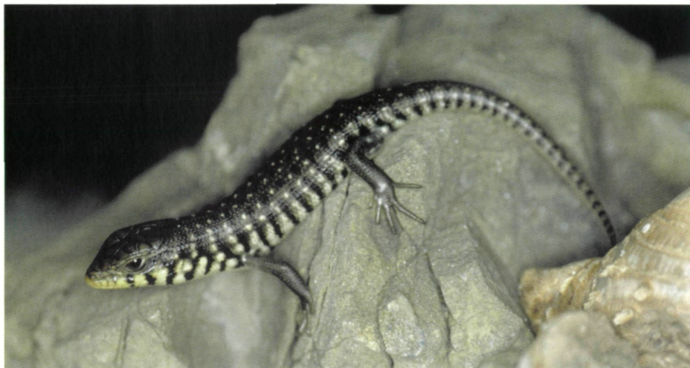
Fig. 7: A few days old specimen of Trachylepis dichroma sp. nov. (Photo: P. HARBIG).

Abb. 7: Wenige Tage altes Jungtier von Trachylepis dichroma sp. nov.