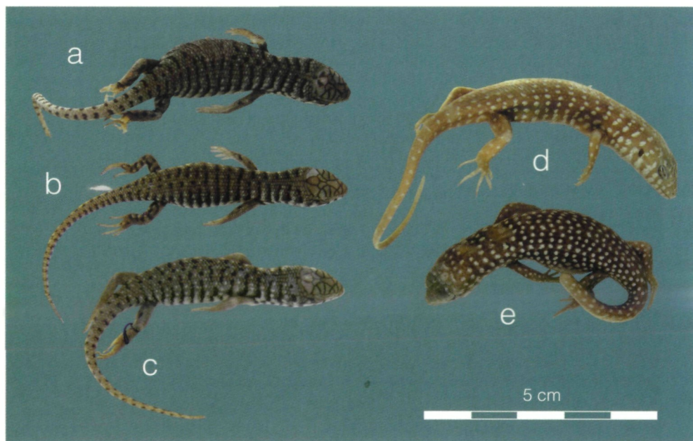
Fig. 8: Dorsal view of three preserved young of Trachylepis dichroma sp. nov. (a - ZMB 57531; b - ZMB 67019; c - ZMB 57532) and two preserved young of Trachylepis brevicollis (WIEGMANN, 1837) (d - ZMB 18301 from Kilimandjaro, Tanzania; e - ZMB 7088 from Keren, Eritrea) (Photo: N. HOFF).

Abb. 7: Wenige Tage altes Jungtier von Trachylepis dichroma sp. nov.