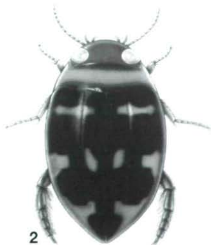
Fig. 1-4: 1 – Habitus and coloration of Neptosternus annettae sp. n. Fig. 2 – Habitus and coloration of Neptosternus leyi sp. n. Figs. 3-4 – Neptosternus spp. n., median lobe of aedeagus in ventral view.