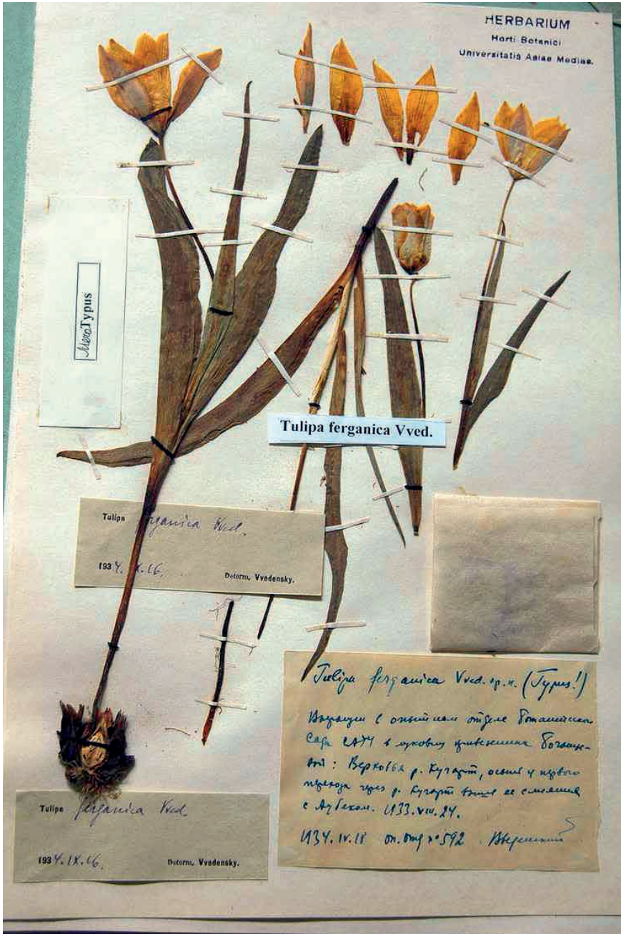
Fig. 1. Type specimen of T. ferganica VVED.